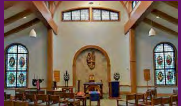
Holy Family Chapel with stained glass from the clerestory (upper) windows from the former Holy Family Chapel.

The installation of the beautiful, historic stained-glass windows in the new Nazareth Center is complete! We are so grateful for the support we received from so many of you for this special initiative. Because of your generosity, our sisters are able to enjoy these beautiful and inspirational additions to their home every day!