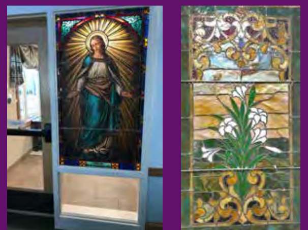
Chapel entrance with Marian window from the former Nazareth Academy; and Prayer room with panels from the former Barbour Hall Academy.