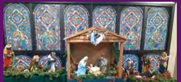
Lobby Lightbox with stained glass from the former Holy Family Chapel.