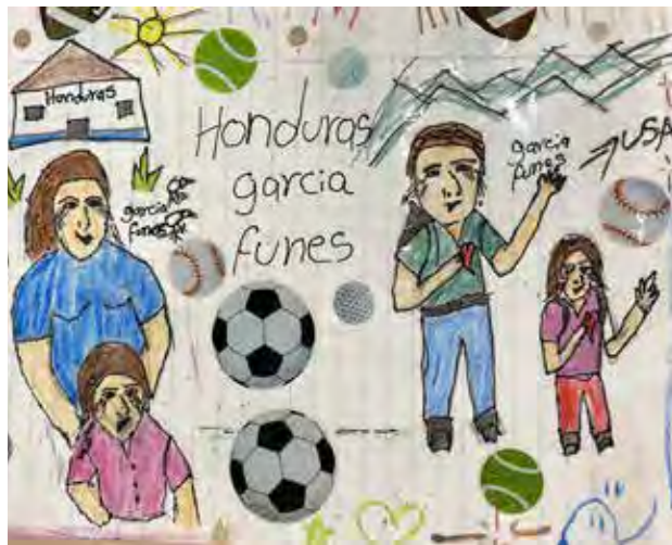
A Honduran child's artwork from the Respite Center. On the right, two figures point to their hearts and to the USA.