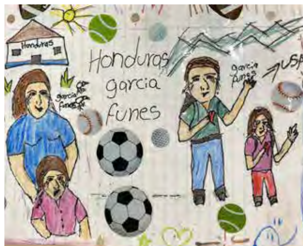
A Honduran child's artwork from the Respite Center. On the right, two figures point to their hearts and to the USA.