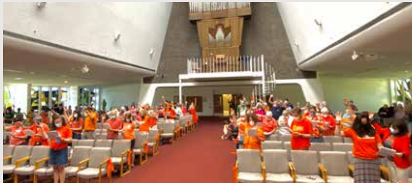
Those who attended the vigil, which took place in the Chapel at the LaGrange Park center, wore orange for National Gun Violence Awareness Day.