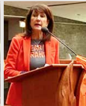
Congresswoman Marie Newman