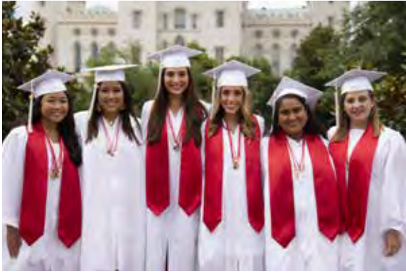
Students from the 2021 graduating class of St. Joseph's Academy in Baton Rouge. Congratulations to all of this year's graduates!