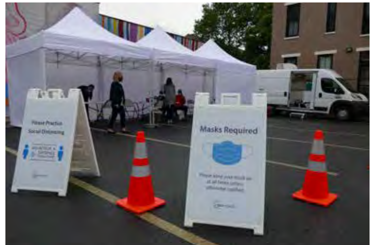
Cincinnati Health Department's mobile vaccination unit.