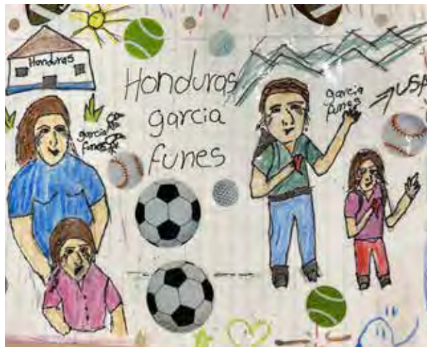
A Honduran child's artwork from the Respite Center. On the right, two figures point to their hearts and to the USA.