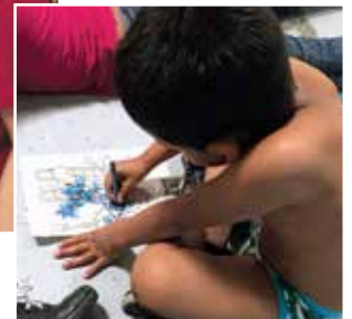
> A little boy colors on the floor with other refugee children.