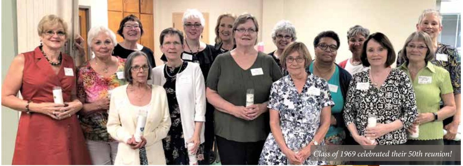
Class of 1969 celebrated their 50th reunion!