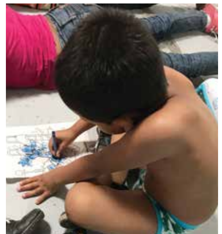
A little boy colors on the floor with other refugee children to help pass the time.