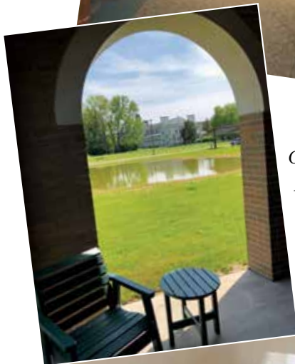
One of many covered porches where sisters can sit and enjoy the beauty of God's creation.