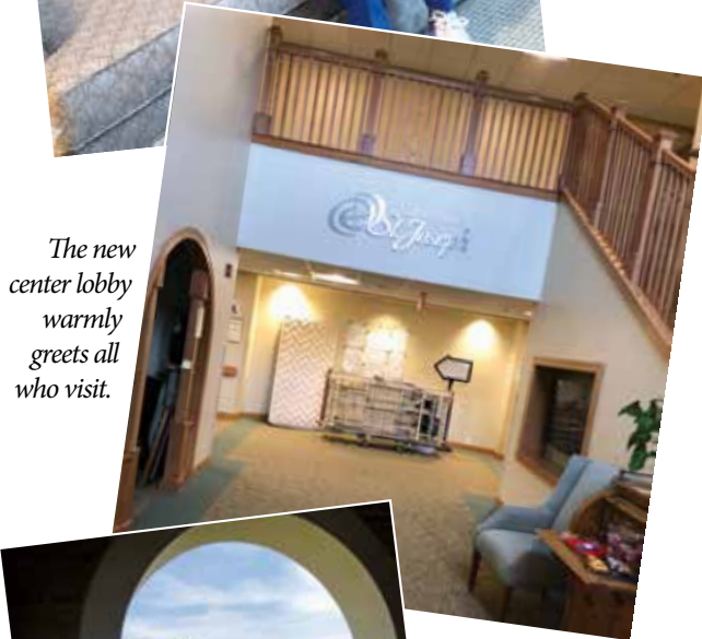
The new center lobby warmly greets all who visit.