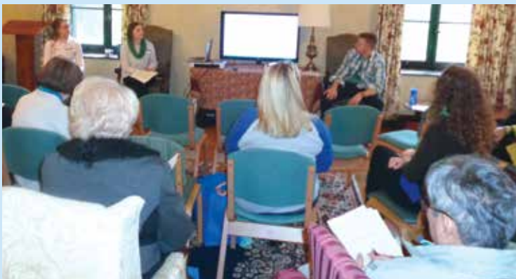
A group participating in “All for One and One for All: Kinship and Caring for Creation,” a Lenten program sponsored by St. Joseph Retreat Center and Catholic Charities of West Virginia.

St. Joseph Retreat Center is a non-profit ministry located at Mount St. Joseph in Wheeling. We serve the community as a means of extending our mission of loving unity to which we, the Sisters of St. Joseph, are called.